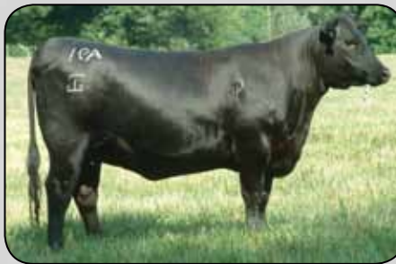
Bred Female, CAM Ranches, GA

5050 has earned a prime position in the Angus breed with his ability to sire easily-born calves that excel for a long list of economically important traits. His carcass stats are incredible and accompanied with his solid growth figures, 5050 is a dependable choice for any program that has their sights set on generating high value cattle that excel for docility.