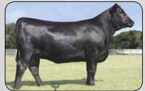
Daughter, Vintage Angus Ranch, CA