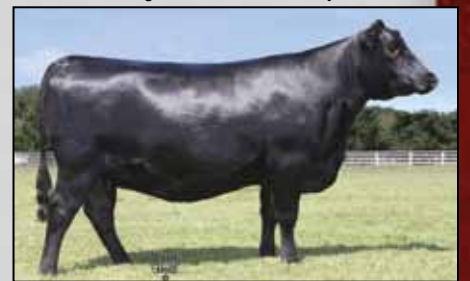
Bred Female, Vintage Angus Ranch, CA