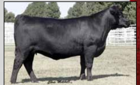
Yearling Female, Deer Valley Farm, TN