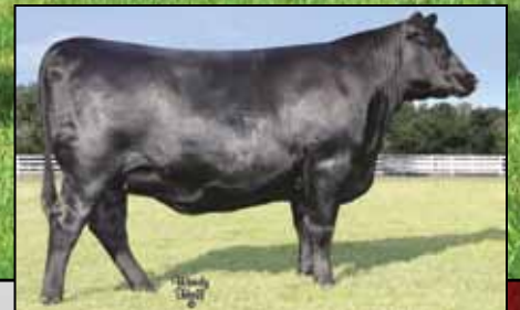
Bred Female, Vintgage Angus Ranch, CA

VDAR New Trend 315 B/R New Design 036 B/R Blackcap Empress 76 N Bar Emulation EXT GAR EXT 4206 GAR 6807 Traveler 1432