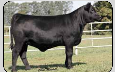
Daughter, Deer Valley Farms, TN