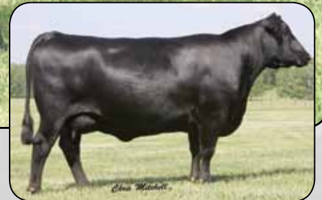
Dam of New Day 454, 44 Farms, TX

AAR New Trend Boyd New Day 8005 SVF Forever Lady 57D B/R New Design 323 B/R Ruby 1224 HF Ruby 036-951