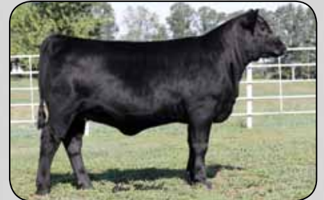
Daughter, Deer Valley Farm, TN